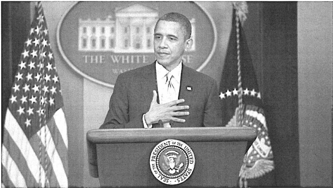
Figure 1 – Visual of President Obama at the Press Conference after the Sandy Hook shooting

The visual and sensory details of how a leader represents himself in speeches, is likely to have an impact on how well he is accepted by his target audience. Obama's speech took place in the White House to a limited amount of people: journalists. Behind Obama is a placed sign of the White House as well as the national flag and the flag of the White House (MacAskill). Showing these certain symbols of patriotism, power and national unity through identity when talking about a national crisis, widens the target audience to every citizen of the country. At the beginning of the speech, Obama was followed by vice president Joe Biden, who stood next to Obama until the Question and Answer session began. The fact that Biden accompanied Obama may show how several people are taking responsibility by demonstrating the seriousness and determination of attempting to find a solution to the issue. Together with the determination shown in the context of the speech and the visual that shows support and seriousness from the White House, Obama reflects a positive image to his target audience, supported by the tone addressed in his speech, which remains neutral and un-provocative.